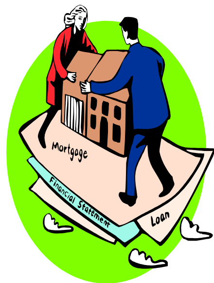
CSCS moves to a new location.